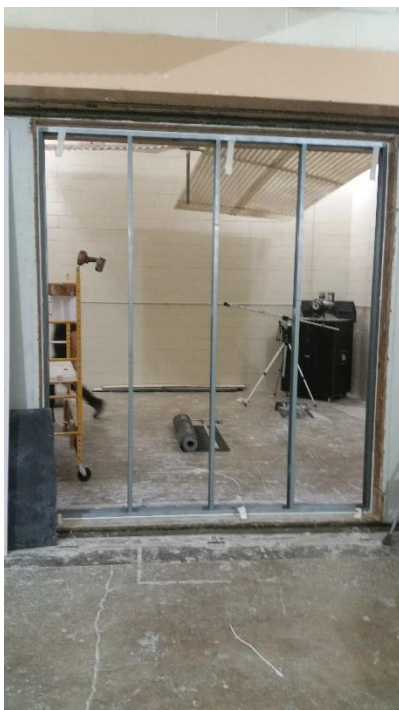
Figure 2 – Framing members installed