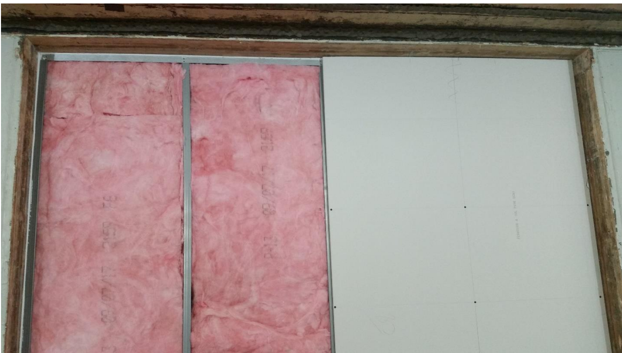
Figure 4 – Stud cavity insulation installed, receive side gypsum board partially installed