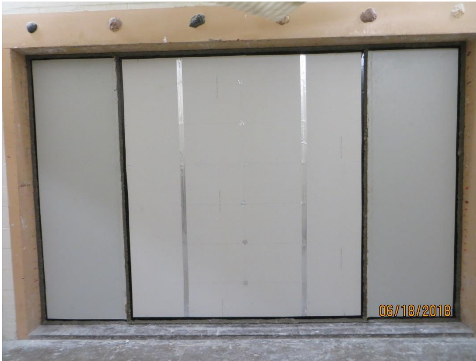
Figure 1 – Completed specimen mounted in test opening, as viewed from source room