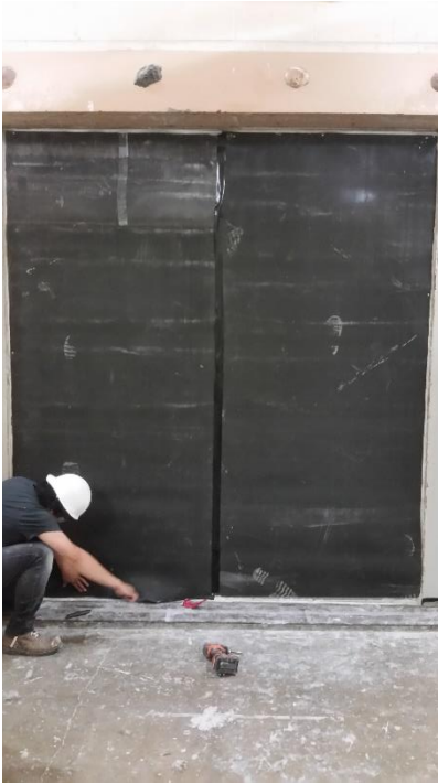
Figure 3 – Mass-loaded vinyl layer installed