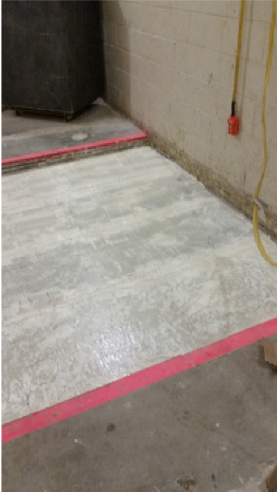
Figure 3 – Adhesive installed on polyethylene sheet over concrete slab