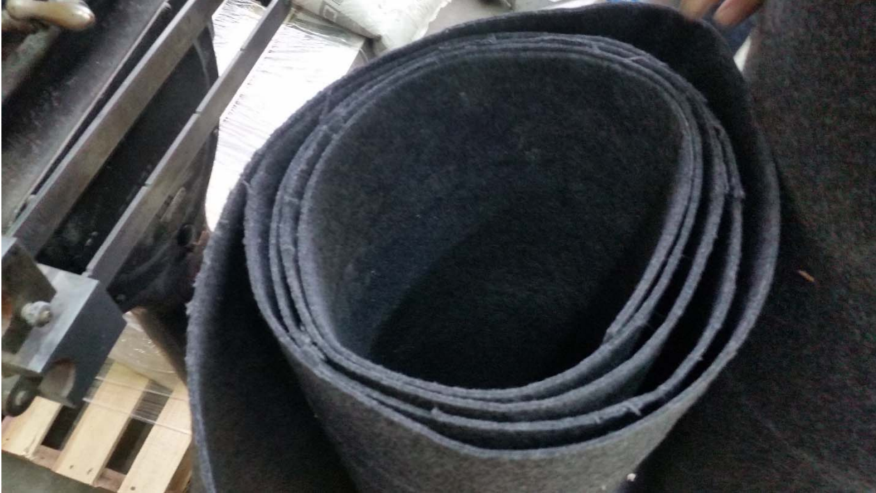
Figure 5 – Detail of underlayment material