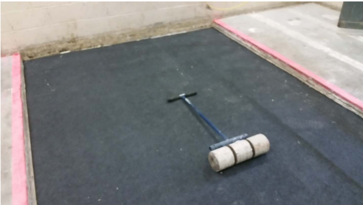
Figure 4 – Underlayment installed, floor roller used in installation