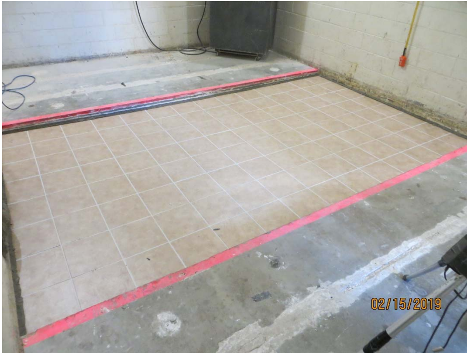
Figure 1 – Completed specimen mounted in test aperture, as viewed from source room.