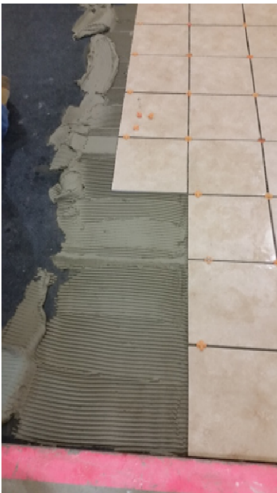
Figure 6 – Mortar and tile partially installed over underlayment