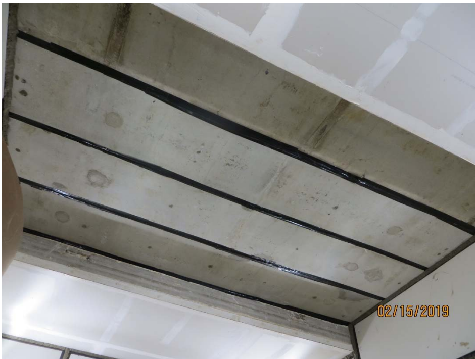
Figure 2 – Completed specimen mounted in test aperture, as viewed from receive room.